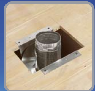
Push pipe through.