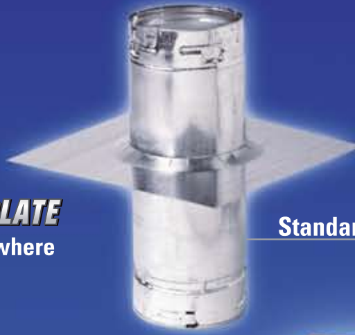
Standard SureGrip - Patent pending