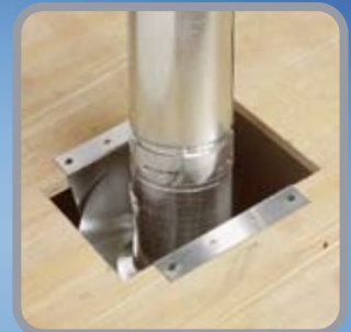
Continue adding pipe sections and termination components. - supports up to 90 lbs.