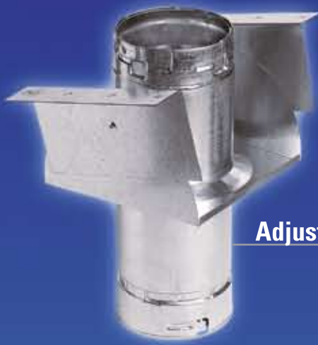
Adjustable SureGrip - Patent pending

Holds pipe tight in position as it penetrates the roof... can't be accidentally pushed down from the roof!