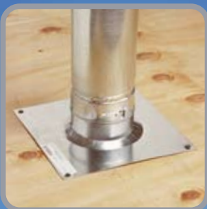
Continue adding pipe sections - supports up to 90 lbs.