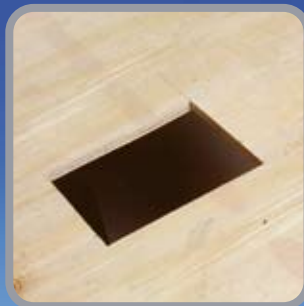
Cut the hole.

Holds pipe tight in position as it penetrates the roof... can't be accidentally pushed down from the roof!