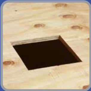
Cut the hole.

The fastest, easiest way to support B-Vent where it penetrates floors and ceilings...just a few minutes and you're finished!