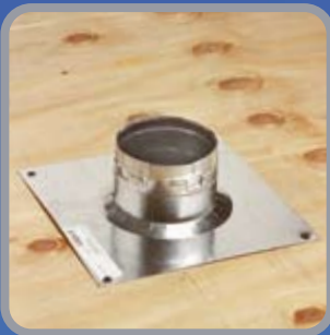
Push pipe through.